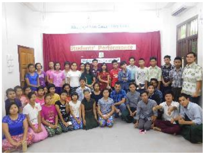
ALL group's photo of the week