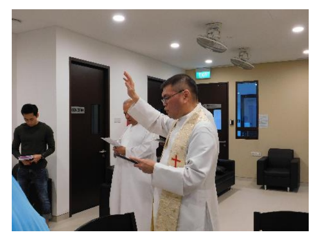
The Therapeutic Group Home was blessed on the 15 August 2017

Boys' Town introduced Therapeutic Group Home (TGH) in July 2017 to provide intensive therapeutic treatment for boys aged 12 to 16 years old who have experienced complex traumas and have difficulties in multiple areas of their lives.