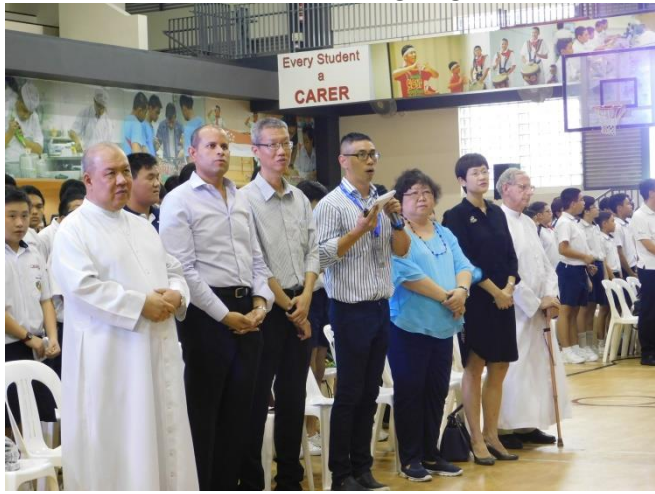
School leaders with the Brothers