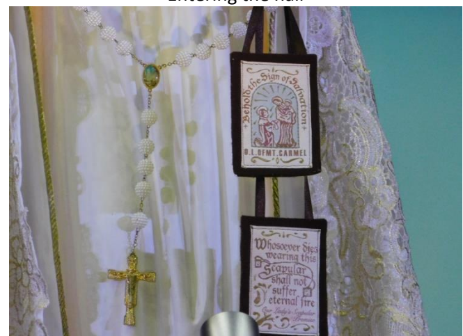
The Brown Scapula in her hand