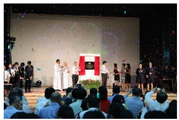
The school hall erupted in cheers and confetti at the unveiling of the plaque signifying the opening of the school building.

to embark on a self-reflection process with the final task of creating a collage that showcased the qualities of Mother Mary. They also learnt about the shared history of Boys' Town, Assumption English School and Assumption Pathway School which aims to build a strong identity as an Assumptionite.