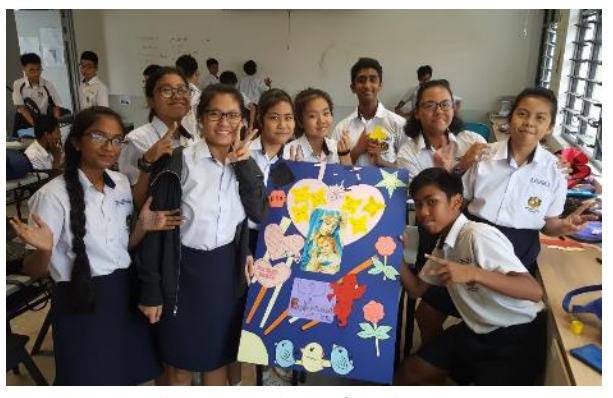
Collage on qualities of Mother Mary

The celebration started early in the morning with a combined mass at Boys' Town for all Catholic students and staff from the three components while the other non-Catholic students were engaged in a series of meaningful classroom activities. The Secondary 1 students were introduced to the life of Mother Mary and the significance of her bodily reception into Heaven. Personal qualities of Mother Mary such as her trust in God, her obedience, purity and humility were highlighted during the lesson and as a post-lesson activity, students worked in groups