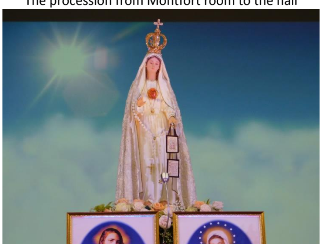
The Blessed Lady was enthroned