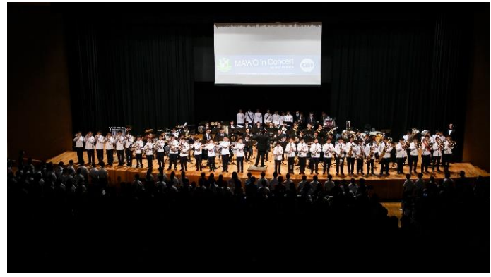
During one of the practices at Montfort School