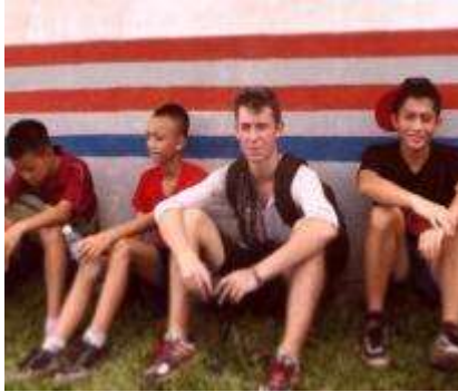
Resting after a game