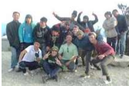
The climb to Mt. Kinabalu