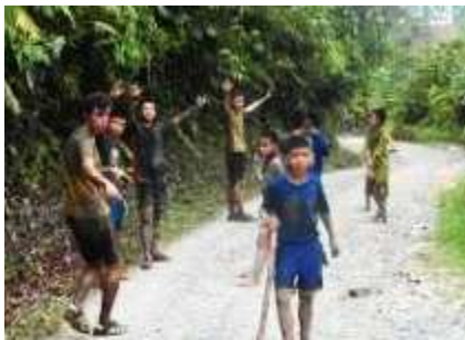
After the football game with the students