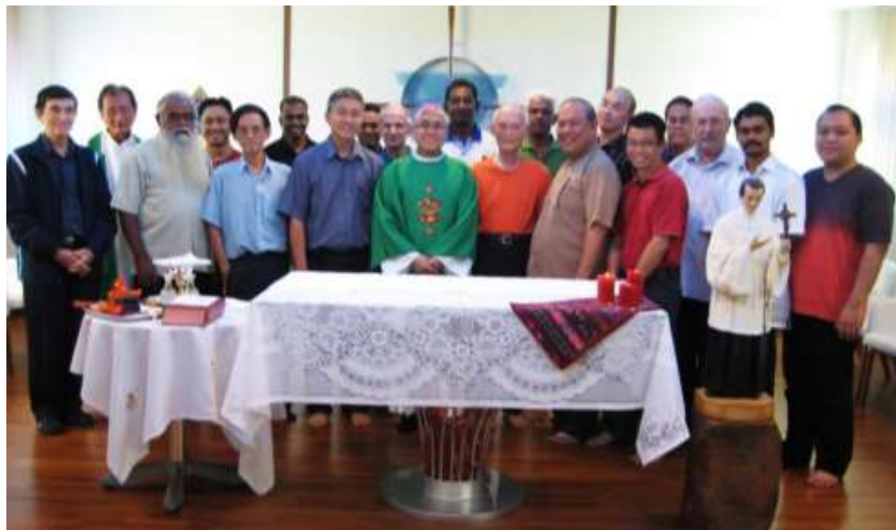
A group photo of the Brothers together with Archbishop William Goh after the Eucharistic Celebration