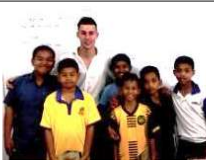
With the students of San Damiano