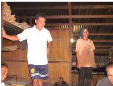
The host (Cosmas' parents)