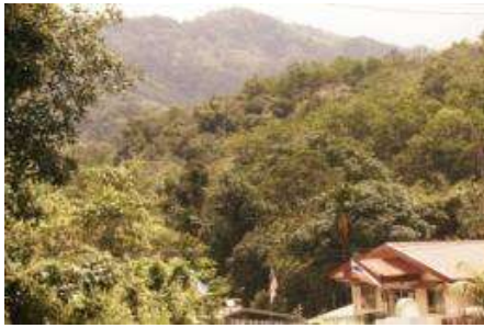
The remote village of Kiulu, Sabah, Malaysia