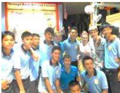
With the graduating students of MYTC 2013