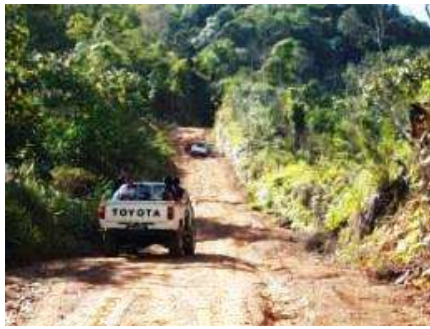
The slippery earth road