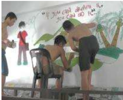
The Words of Wisdom