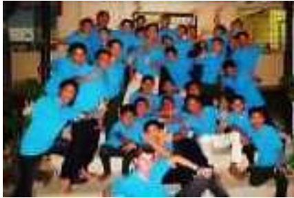
The Students of San Damiano's Hostel